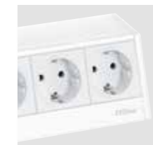
white white modules